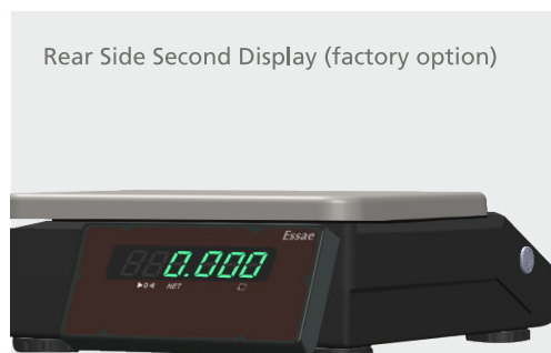
Rear Side Second Display (factory option)

Robust IP68 & IP69K Shield with Silicone Potting