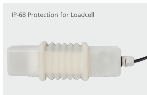
IP-68 Protection for Loadcell